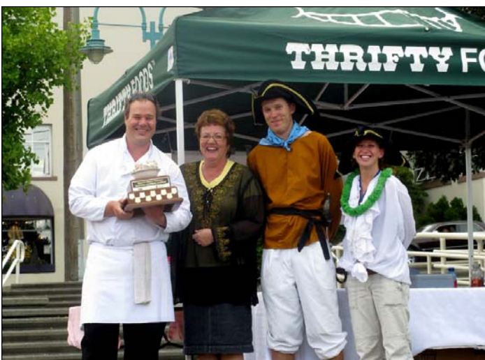
The Green Olive Bar and Grill impressed the crowds again to take the People's Choice Award for the second year in a row at Chowder Fest.

Chinese Free Masons, Coast Bastion Inn, Downtown Nanaimo Partnership, Island Farms, Nanaimo Toyota, St. Jean's Cannery, Steve Marshall Ford Lincoln Ltd., The Harbour Chandler, Thrifty Foods, VIHA & Woodgrove Centre