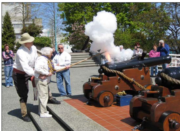
This lucky cruise ship passenger celebrated her 90th birthday by firing one of the Bastion's authentic 19th century cannons this summer.